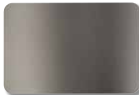
GR —MATTE GREIGE