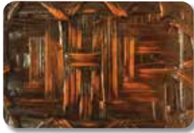
A —ANTIQUE WOVEN BAMBOO

DUE TO THE NATURE OF MATERIALS; FINISHES COLOR, TEXTURE AND SHADING MAY VARY