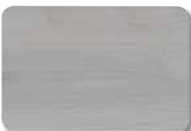
WW —WHITE WASHED