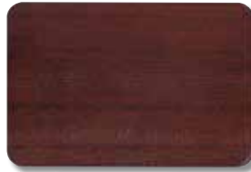
DC —DARK CHERRY