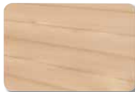
P —NATURAL PALM