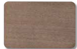
WP —WASHED PINE