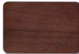
WK —WHISKEY WOOD