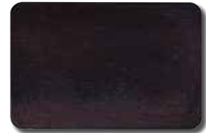
DWA —DARK WALNUT