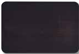
DZ —DARK BRONZE