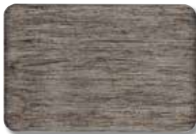
WE —WEATHERED WOOD